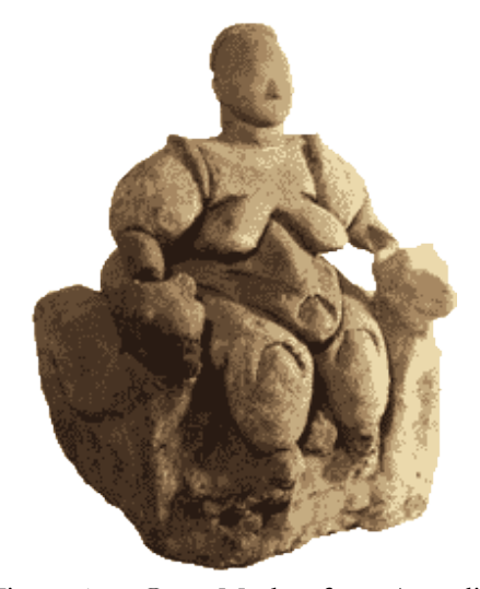
Figure 6 — Great Mother from Anatolia

Goddesses may be divided in four groups: each female divinity seems to have a preference for one of the elements - earth, fire, wind and water – even though, occasionally, devotees associate more aspects to the same deity. Earth Goddesses are typically associated to fertility, maternity, abundance of crops and food, such as Cybele and all ancient large Goddesses from Anatolia, Cyprus, Malta. Archeological evidence shows Earth Mothers sided by felines, to represent the women's strength, immanent to the reproduction of life, but also as symbols of power and command, as part of a throne. (Figure 6).