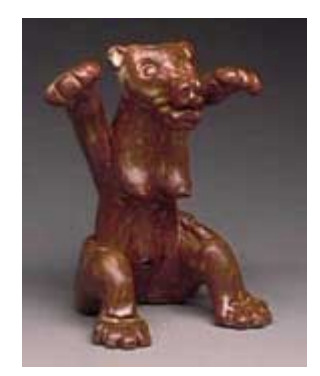
Figure 2 — Nyavirezi

She is represented as a princess-lion still very popular in Rwanda: in ancient times (oral history sources speak about 5000 years ago) she was the daughter of a king who transformed herself in a feline divinity during a conflict. Sometimes she is portrayed standing in a fighting pose in order to protect herself or her offspring, with her two upper breasts full of milk, conveying the message that deep inside every woman there is a lioness that can manifest herself when needed.