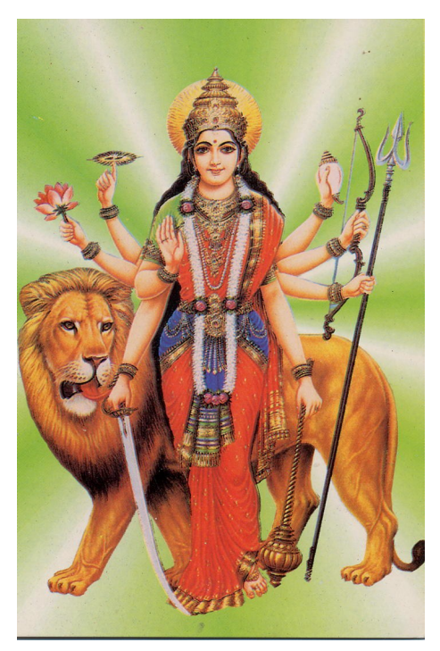
Figure 4 B — Durga Goddess

Here again we see a representation of the relationship between women and felines. Still today, women who worship Sekhmet or other feline-related Goddesses, look at her as the embodiment of 'resistance, independence and affirmation, Goddess of medicine, justice and protector' (Maria Giusi Ricotti²). A survival of this aspect of the Goddess can be seen also in the European Tarot cards (the oldest decks have been dated to the 14 hundreds in the area between Marseille, France and Vitoria, Basque country). We can see among the 22 major arcanes 'The Strength', represented as a woman in the position of effortlessly dominating a lion or opening its mouth with a serene smile on her face. The type of power she signifies is not robust, muscular or brutal; it is a form of command made of authority, control, and fairness, the strength of sweetness and wisdom. Quite late in the witch hunts, in the 16 hundreds, Tarots became illegal, considered as a witchcraft tool by the Inquisition prosecutors.