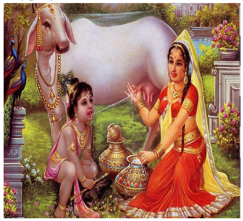
Figure 5 — Krishna and Ashode

In the Aryan Trimurti, the three main Gods - Brahma, Vishnu, and Shiva (respectively the creator, the conservator, and the transformer/destructor) - also have a Goddess side. They are often represented as a whole: an harmonious embodiment of the masculine and the feminine principles as a guarantee of the continuity of life. Saraswati, Goddess of all the arts is coupled with God Brahma, the creator. Laksmi, Goddess of abundance, is associated to Vishnu, Lord of conservation. God Shiva, the transformer is married with Kali in the non-warrior aspect, named Parvati, Goddess of fertility and symbol of maternity. She is linked to the sacred cow as well as other maternal figures, in Hinduism all mothers are dispensers of life, milk, love. (Figure 5).