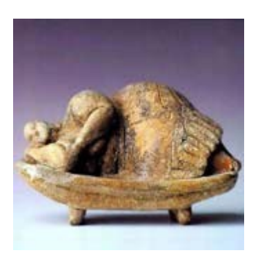
Figure 1 — Great mother