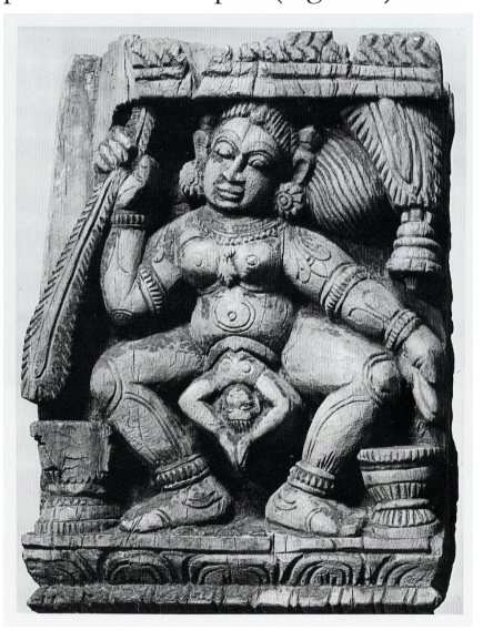
~350~ © Sociologists Without Borders/Sociologos Sin Fronteras, 2011

The Goddess as Great Mother necessarily brings us back to ancient times, when the generative power of women was considered sacred and was represented in temples (Figure 8).