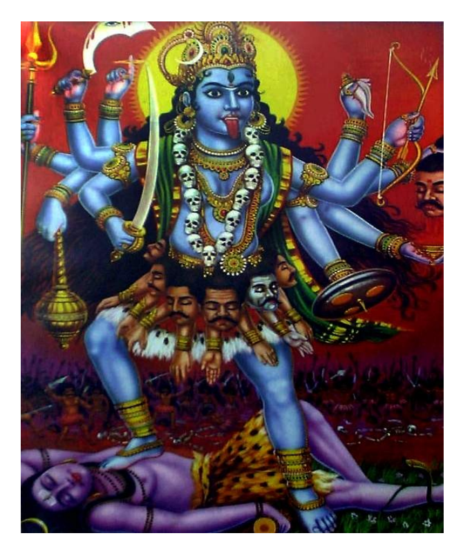
Figure 4 A — Maha Kali Goddess