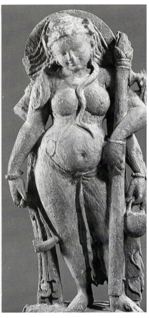
Figure 7 (A and B) — Pregnant Goddesses

Another lady has the disturbing task of signifying death in popular iconology: the crone. This is one of the aspect of the Goddess' trinity (maiden-mother-crone) representing a re-generative body, the eternal capacity of nature to reproduce life in different forms that can be confused and mixed, in a never ending spiral (Gomberg 2001).